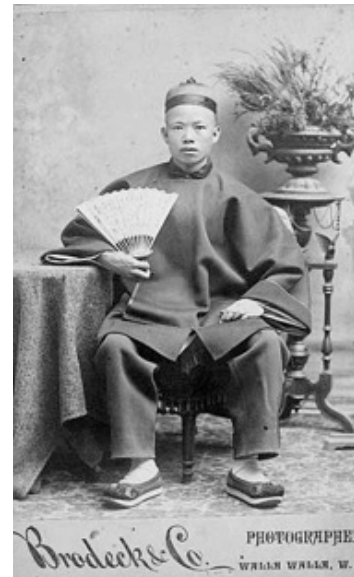
Chinese man dressed in traditional clothing, Walla Walla, Washington, ca. 1880.