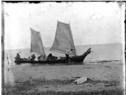
Dugout canoe with two sails, ca. 1900.