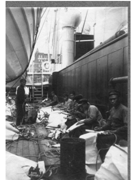
Chinese Crew Making Horse Slings, Seattle, August 1899.