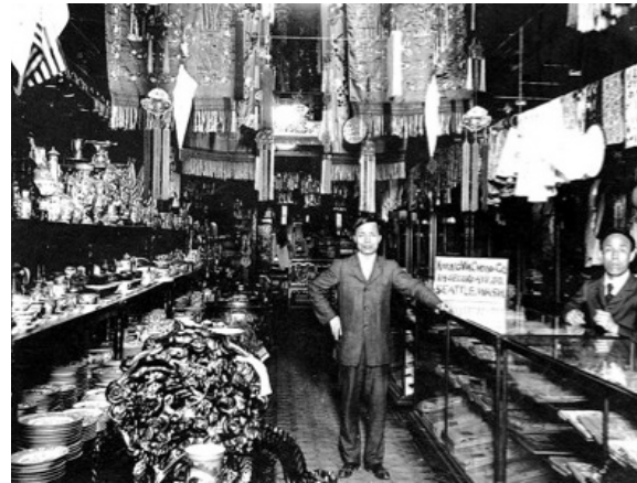
Kwong Wa Chong Co. store interior, 1909.