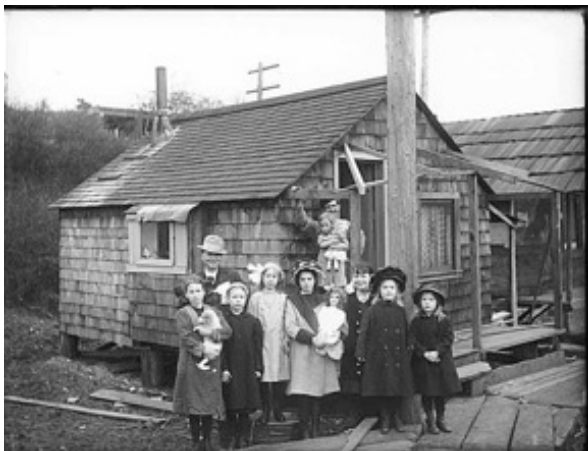
Family in front of their cabin, Seattle, ca. 1910.