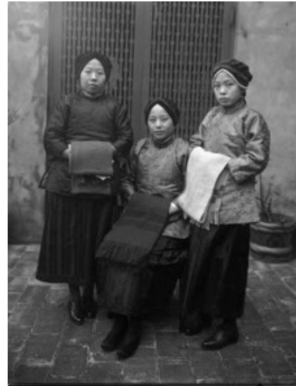
Women from the Chinese Silk Commission, ca. 1920.