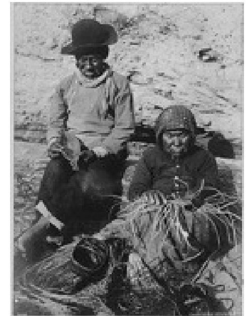
Puget Sound Salish Indian couple with crafts on beach, West Seattle, Washington, 1899.