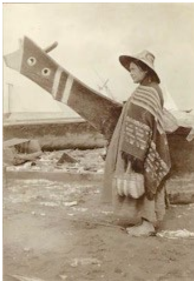
Indian woman and canoe at the Seattle waterfront, 1898.