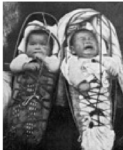
Native American babies in cradleboards, probably Vashon Island, n.d.