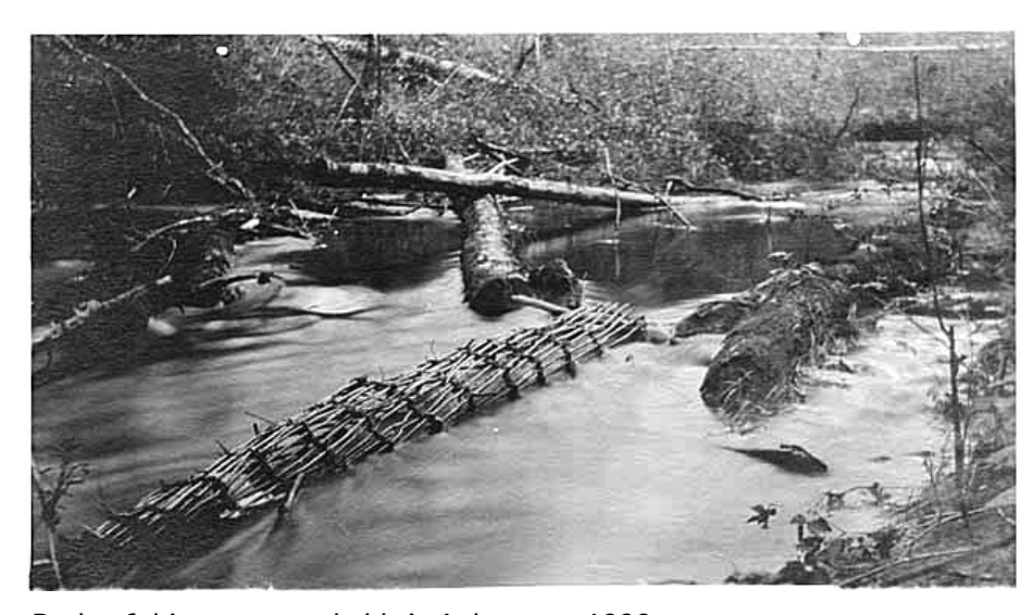
Basket fishing traps, probably in Auburn, ca. 1923 (Neg. No. 439)