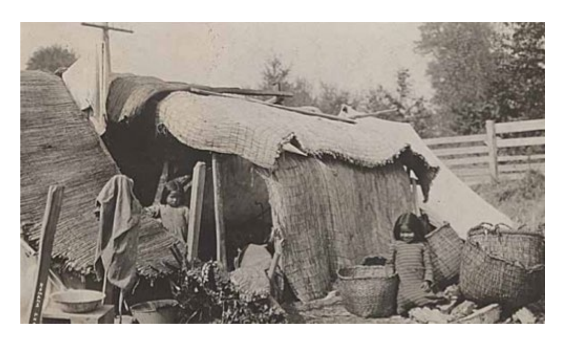
Native American children near shelters.

What did the Native American tribes of the SR 520 corridor region contribute to the culture of King County/Washington state?